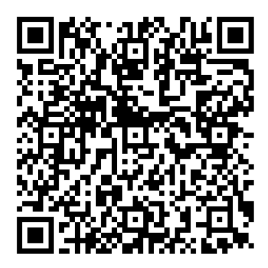
Volunteers Needed Building Playhouse for Drake House