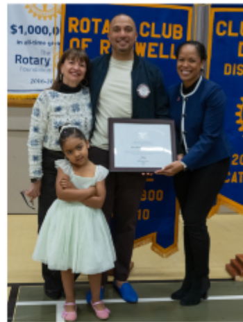
Frederick Levy Award for Hours of Service